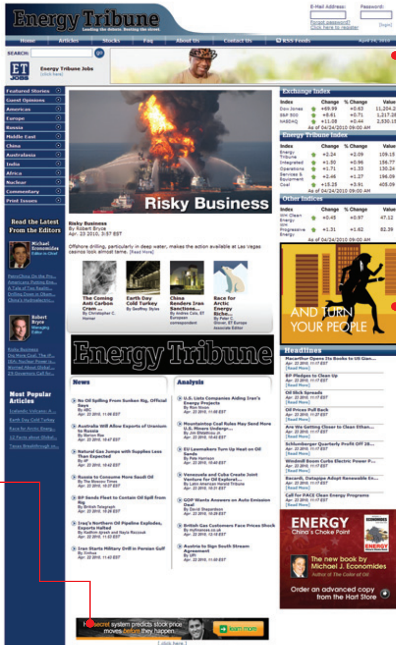
Leaderboard 728 x 90

Graphic banners offer you the chance to deliver targeted branding and messaging to Energy Tribune's readers. Choose from a variety of sizes, and work with one of our online advertising specialists to get the most from your campaign. Energy Tribune supports video, animated, static, Flash, interactive, and HTML text based advertisements.